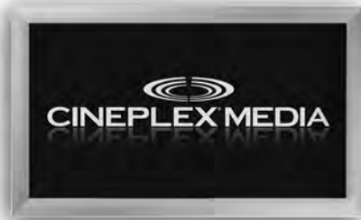
16x9 LCD Office Food Court Screens